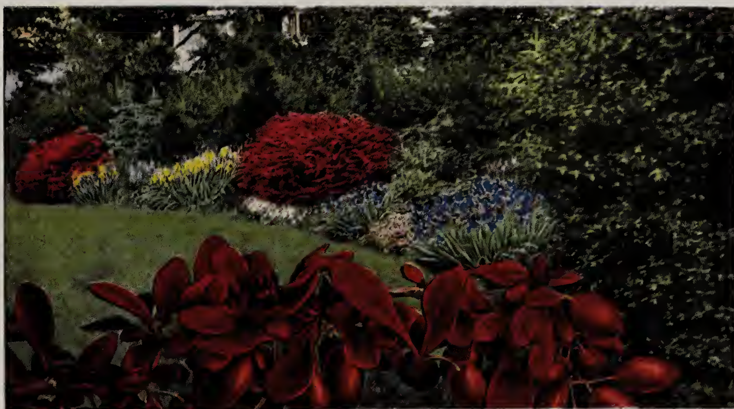
THE NEW BLOOD-LEAVED BARBERRY 50 cts. to $1.00 each, according to size. See page 6